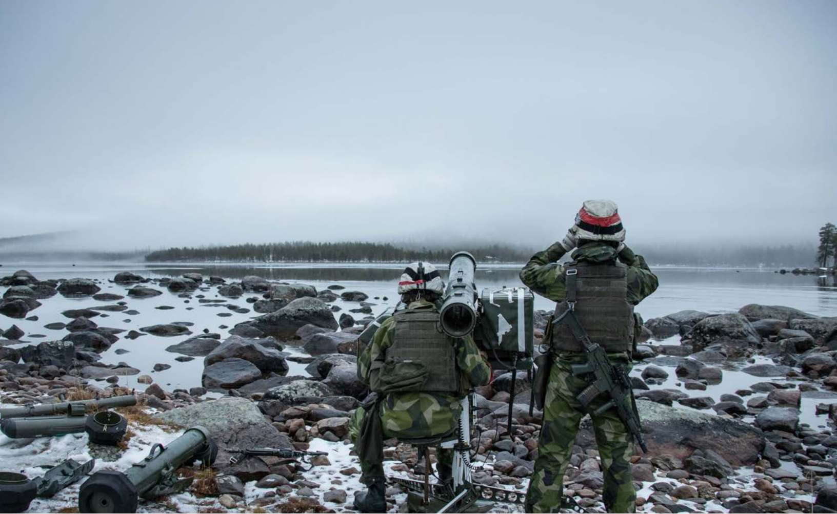
Swedish Armed Forces during Trident Juncture 2018. Robot 70 Air defence soldiers preparing their firing position in the foggy landscape view at the bridge. NATO North Atlantic Treaty Organization.

reach 2.5% by 2030. The biggest improvement in capabilities in the region has been the acquisition by Denmark, Norway, and Poland (as well as the Netherlands and the United Kingdom) of the F-35 Lightning II fighter, the only allied aircraft with the capability of penetrating Russia's S-400 air defenses. Finland and Sweden have sharply strengthened their security cooperation, and their bilateral and trilateral ties with the United States.