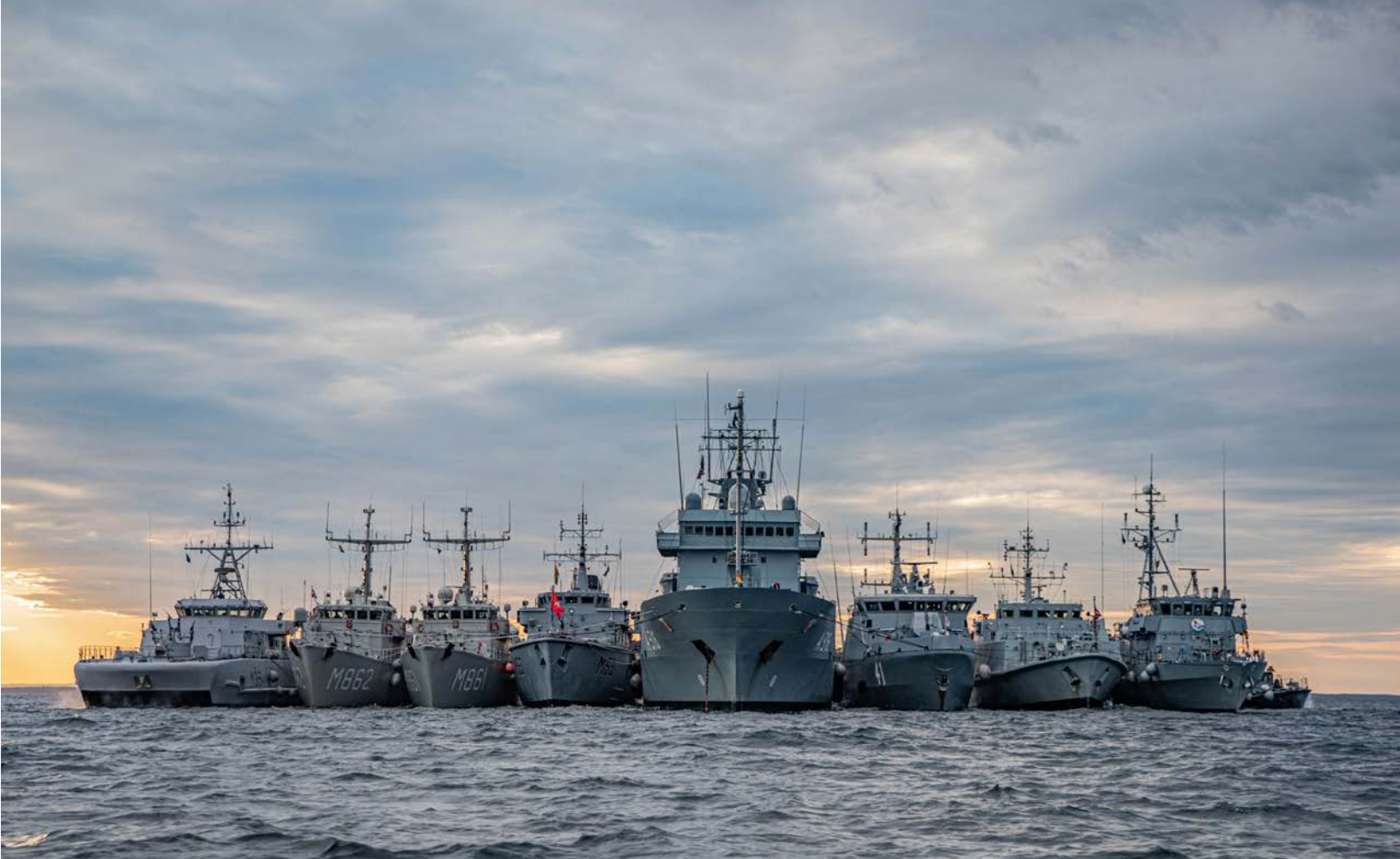
BALTIC SEA (June 16, 2020) Photoex with (left to right) Royal Norwegian Navy HNOMS Otra (M351), Royal Netherlands Navy HNLMS Zierikzee (M862), Royal Netherlands Navy HNLMS Urk (M861), Lithuanian Navy LNS Skalvis (M53), German Navy FGS Donau (A-516), Finnish Navy FNS PurunPAA (41), British Royal Navy HMS Ramsey (M110), German Navy FGS Groemitz (M1064) in the Baltic Sea during BALTOPS 2020, June 16. BALTOPS is the premier annual maritime-focused exercise in the Baltic region, enhancing flexibility and interoperability among allied and partner nations. Standing NATO Maritime Group 1.