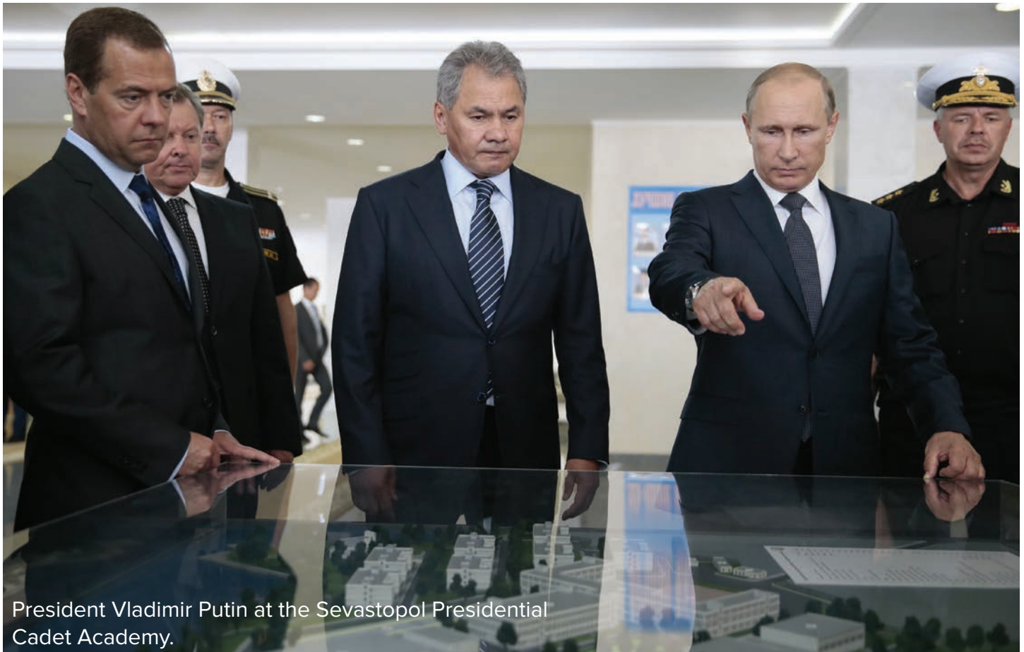
President Vladimir Putin at the Sevastopol Presidential Cadet Academy.

The Kremlin continues to reserve the right to use nuclear weapons in response to the use of nuclear or other weapons of mass destruction against Russia or its allies, and even in the case of a conventional assault on Russia that would endanger the existence of the state. 9 The Russian Navy aspires to acquire or produce nuclear-powered battle cruisers, with plans for a nuclear-powered supercarrier. New submarines with ballistic missiles would also increase the defensive-deterrence capacity of Russia's submarine fleet.