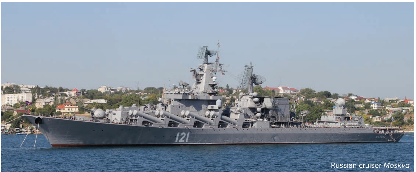
Russian cruiser Moskva

The Black Sea Fleet is incorporated into Russia’s Southern Military District, which consists of the former North Caucasus military district, the Caspian flotilla, the 4th Air Force and Air Defense Command and the Black Sea Fleet. Since the collapse of the Soviet Union, the Black Sea Fleet has been a mainly “green water fleet” with limited high-seas capabilities. 3 It operates one guided missile cruiser, the Moskva , one classic submarine, three frigates, seven large landing ships, and several small antisubmarine warfare boats and small missile or artillery boats.